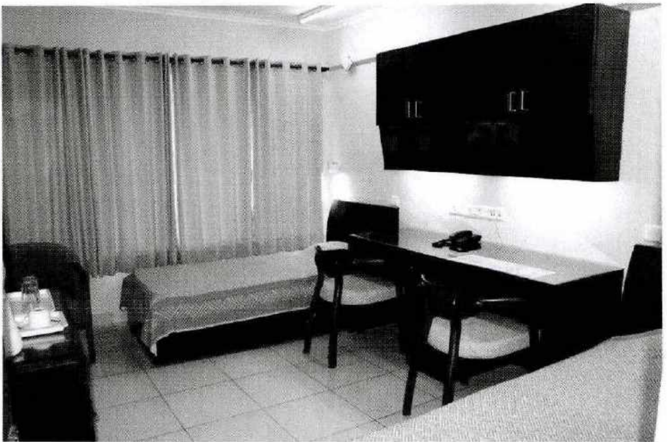
Narmada Hostel Room