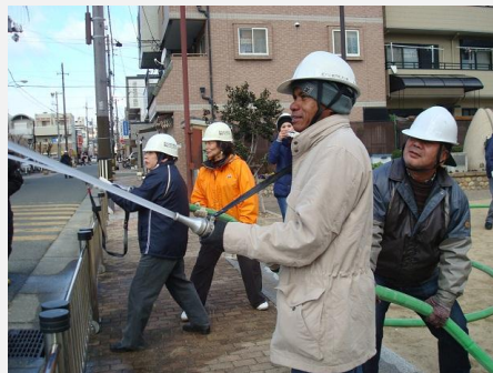
Community organization implementing a fire extinguish drill