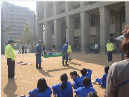
Staff of Fire Bureau conducting emergency training to school children