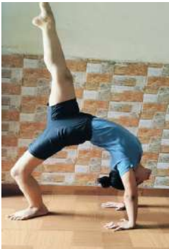
EK PADA CHAKRASANA