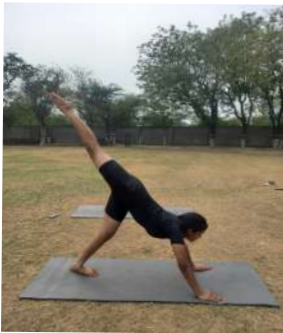
EK PADA SHVANASANA