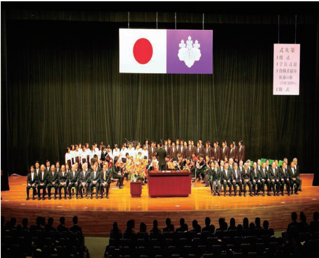
Graduation Day at the University of Tsukuba

In this seminar, students are expected to make oral presentations of case studies, applying the tools of Economic Sociology (networks, market formation, value chains, etc.). It also involves discussion and debates related to economic development, market failures, risk and uncertainty, etc.