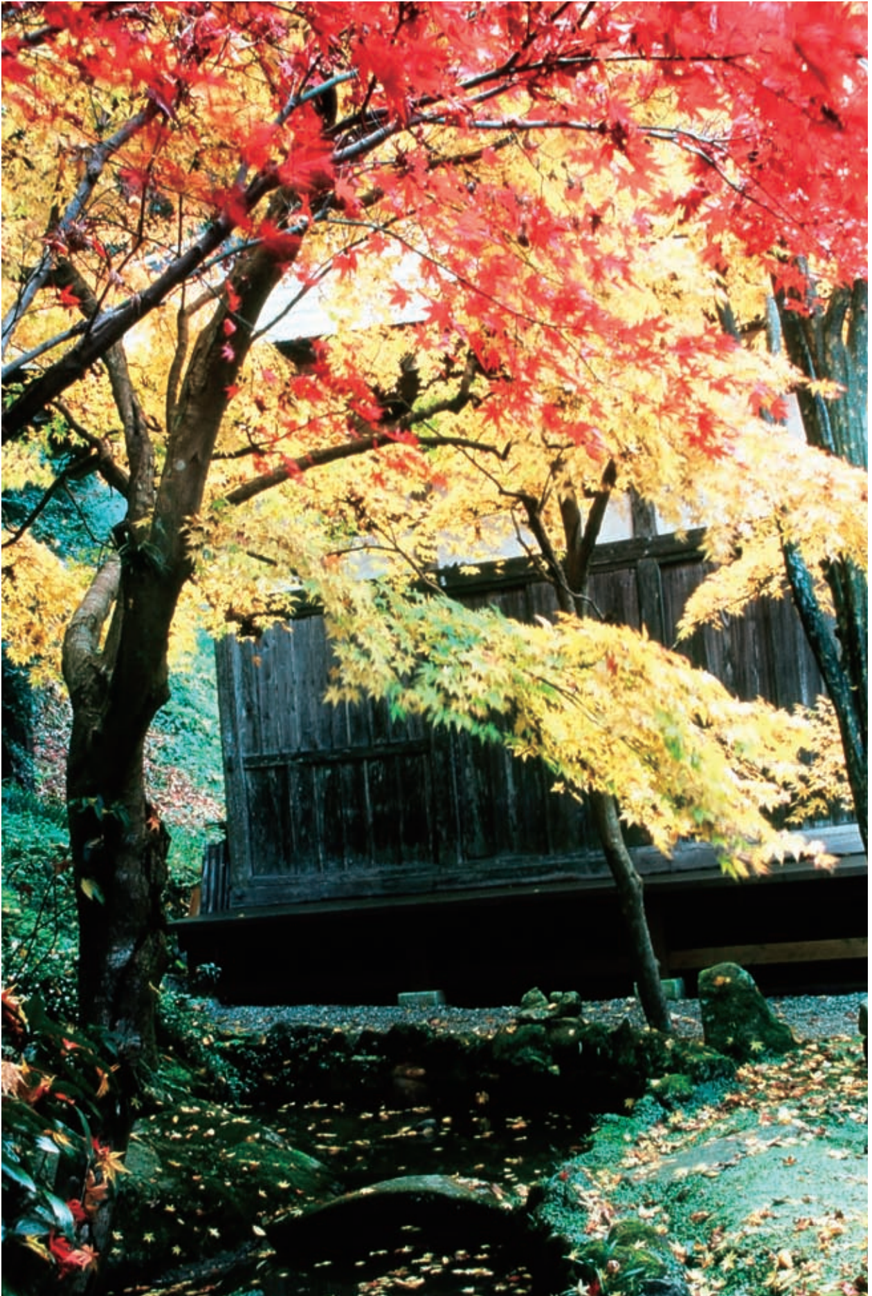
Tsukuba City, Fall Landscape