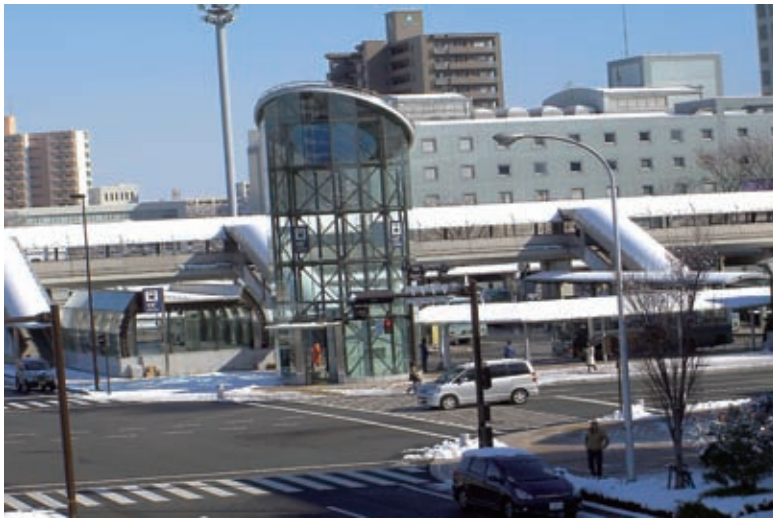
Tsukuba Express station

Alps are no farther than 120 km. The trip to Tsukuba from Tokyo, by train, takes just 45 minutes. Direct regular bus services link Tsukuba to Narita airport in about 90 minutes, to Haneda airport in about 120 minutes, to Tokyo station in about 90 minutes, as well as to Kyoto, Osaka and a variety of further cities.