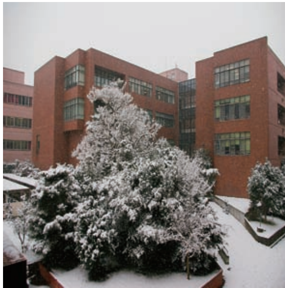
Graduate school building

Fifteen scholarships are provided by the JJ/WBGSP for this purpose. To be eligible, a candidate must be a national of a World Bank member country that is currently eligible to borrow from the Bank. In addition, Executive Directors, their alternates, and staff of the World Bank Group, including consultants, as well as their close relatives, are excluded from consideration.