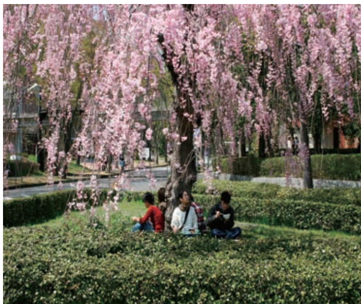
Spring at the University of Tsukuba

cific for each Course. Participants from each Course will, however, be free to choose elective subjects from either of the two Courses listings. Each main (lecture) subject carries 2 credits. In addition, participants will be required to take a set of introductory subjects during their first term (see below) and, during the second year of the program, to write a master's thesis. Each student will have an advisor, who will supervise thesis work and other academic activities. Regarding academic endeavors, participants will receive counsel from their advisors. They are encouraged to consult with them whenever they feel they should do so. Our