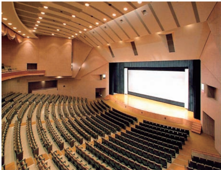
Auditorium

This course, at first, introduces the main concepts of substantivist economic anthropology derived from the theory of Karl Polanyi. Then, based on these concepts, the course deals with the process of interaction between traditional societies and the global force that is realized through the state. This process is actually examined by the ethnography produced by fieldwork of the lecturer.