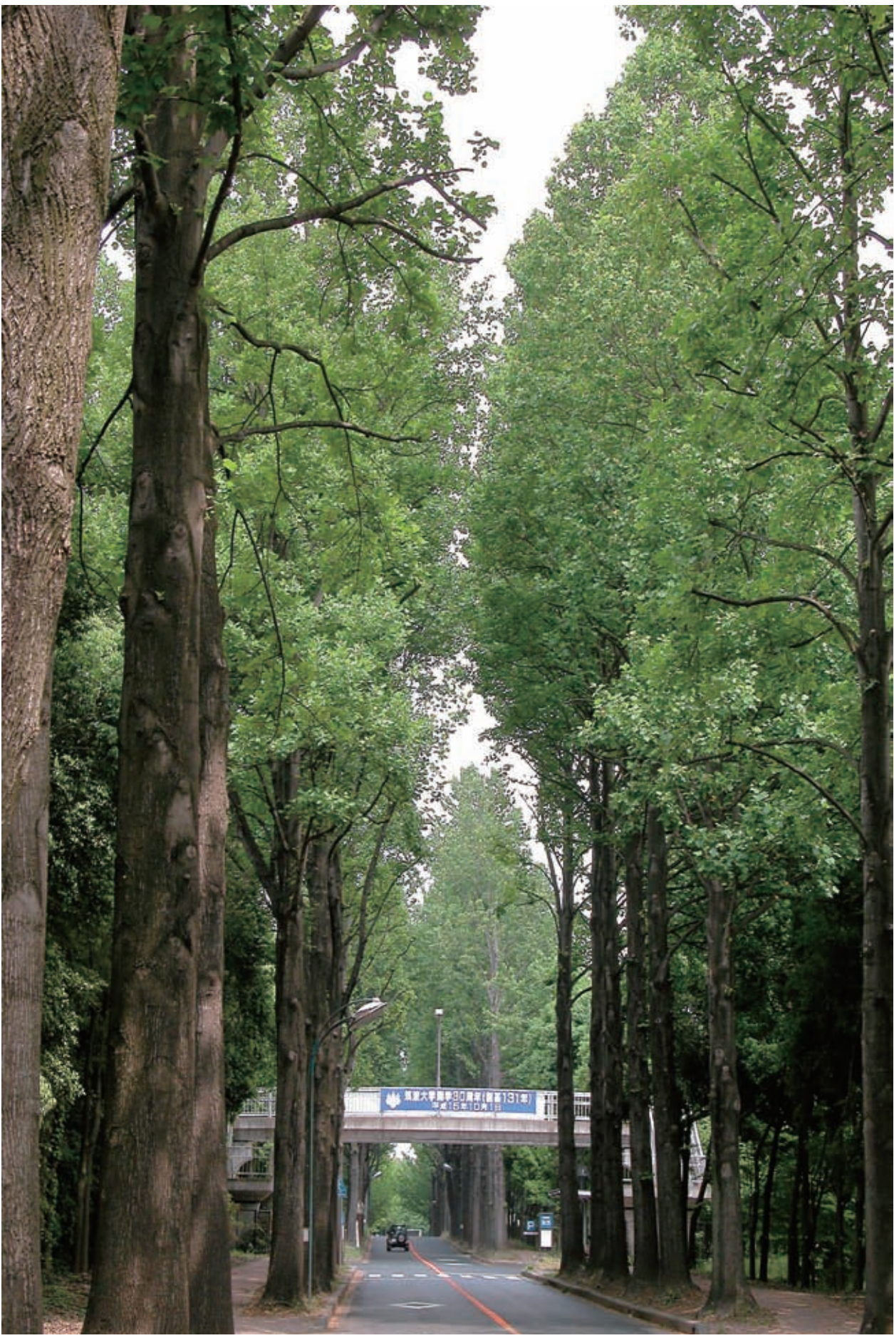
Tree-lined avenue leading to the University of Tsukuba