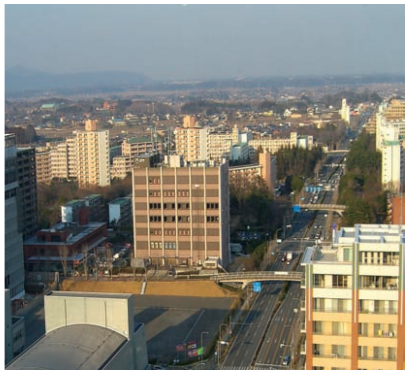
Partial view of Tsukuba City

Most of the housing facilities in Tsukuba Science City have been designed to facilitate a living environment that integrates professional and home life activities. The Tsukuba University Hospital is recognized as a first rate regional health care facility, and the Tsukuba Medical Center as well as several other private hospitals are additional providers of medical care. Thirty eight elementary schools, fifteen junior high schools, and three high schools operate in the residential areas. In addition the city possesses many parks and other green areas.