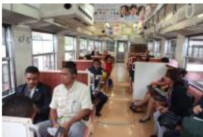
Traveling by train